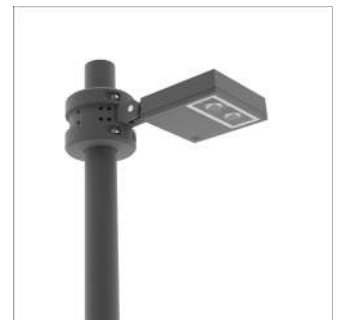
14099696 - Mounting Collar for 3.5" Pole with 311043 Bracket