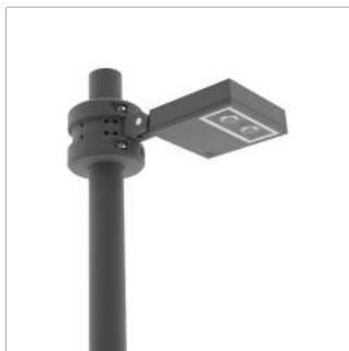
14099896 - Mounting Collar for 2.3" Pole with 311043 Bracket

Performance in Lighting reserves the right to make all necessary changes without prior notice.