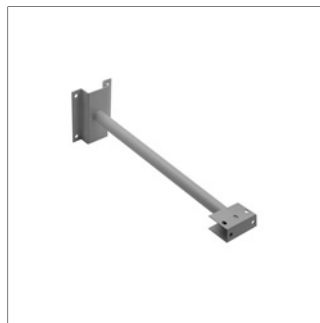
14173394 - 20" Wall Support