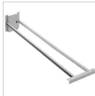
14453994 - 40" Wall Support